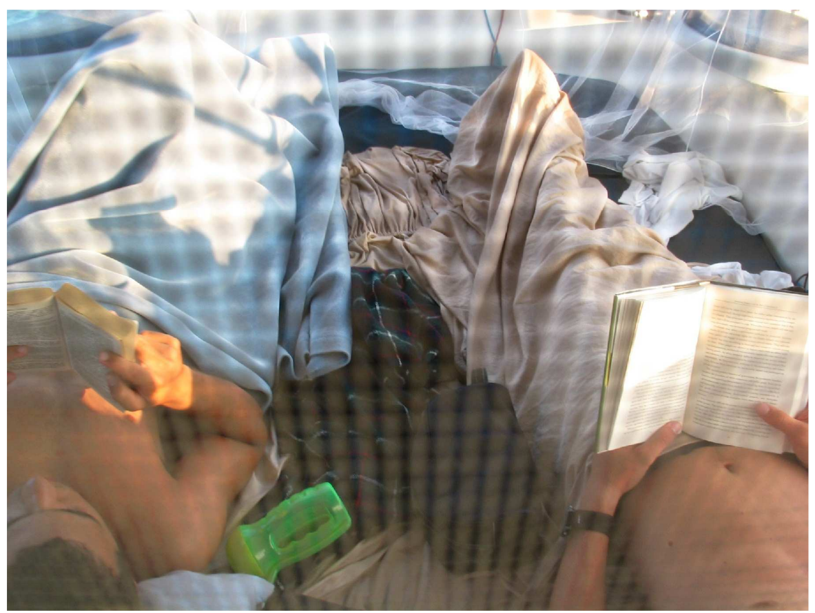
Most days begin with relaxation in the cool of the morning

We were up bright and early and planned to make the approximately 30 mile run to Chub Cay to refuel and anchor in position to head back across the Great Bahamas Bank the following day. We had not fueled since Alicetown in the Bimini Islands and had motored during most of our travels. I was down to around <sup>3</sup>/<sub>4</sub> of a tank and would be well below half by the time we reached Chub Cay. I was eager to get going, but it was the Bahamas after all, so we didn't depart until around 0815.