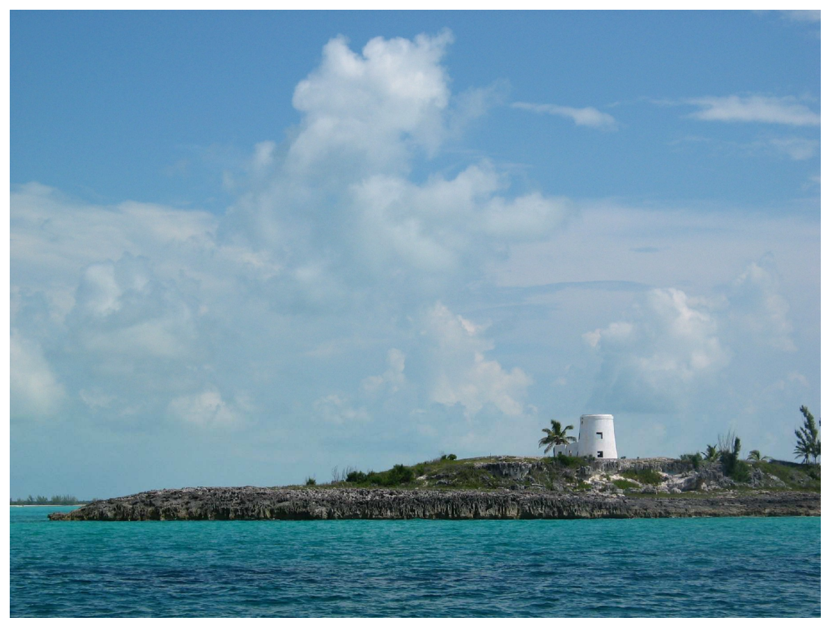
Abandoned lighthouse off Whale Cay en route to Chubb Cay

We debated for quite some time while slowly motor sailing past the harbor toward the Northwest Channel Light. Our machismo finally got the better of us and we agreed that we would do what sailors do; sail. We would conserve our fuel and use it only if the wind completely died or we needed to get out of harms way. This was supposed to be an adventure after all. I didn't much like the prospect of turning the 70 mile crossing into a 24 hour ordeal, but I relented and we proceeded on.