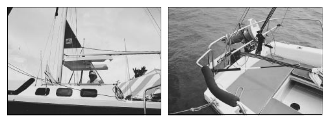
Above left: When raised, the pop-top gives 6' 4" headroom below. It is unusual in its use of telescoping supports. When it's down, headroom is about 50". Above right: The mainsheet traveler is a rod extended between the twin backstays—handy to the helmsman, and it cushions the effect of a jibe, but what about wear on the rig?

upon your inclinations; there's a molded-in socket for a supporting leg. Or, you can fold the top section down to let you see what the kids are doing in the cabin. Or, you can remove the door completely and stow it inside the gunwale.