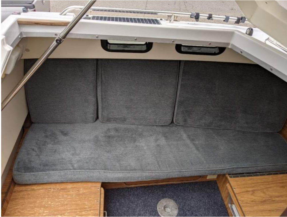
Cabin looking forward into the V-berth